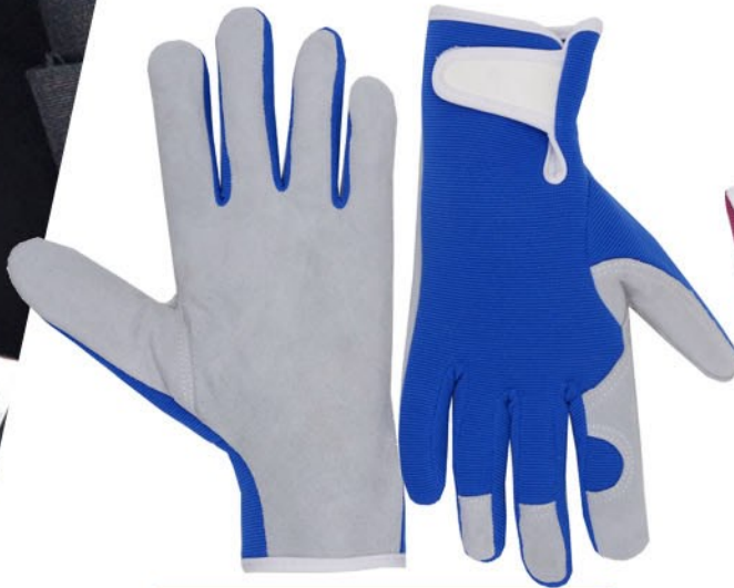
Code : SS-1917

Made by cow split leather and fine fabric