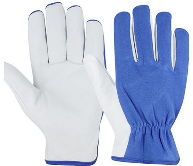
Code : SS-91004

Constructed of soft and strong goat skin leather provides the gloves excellent dexterity and touch sensitivity.