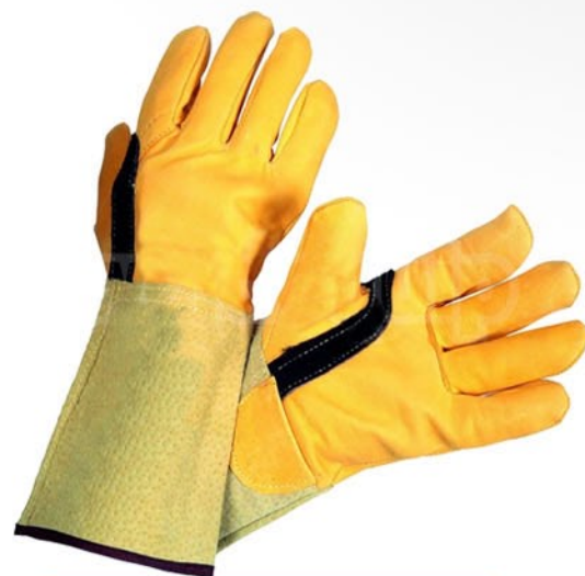
Code : SS-1314

Welding glove made by Goat leather and cuff with cow leather