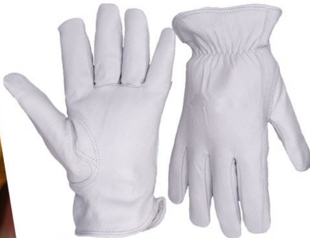
Code : SS-1527