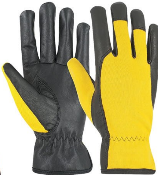
Code : SS-91003

Constructed of soft and strong goat skin leather provides the gloves excellent dexterity and touch sensitivity.