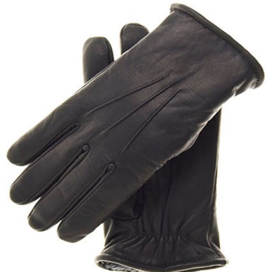
Code : SS-2108