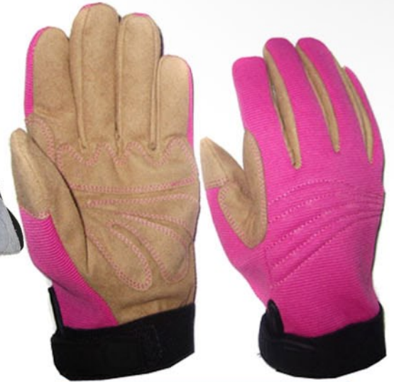
Code : SS-1926

Made by synthetic leather and fine fabric