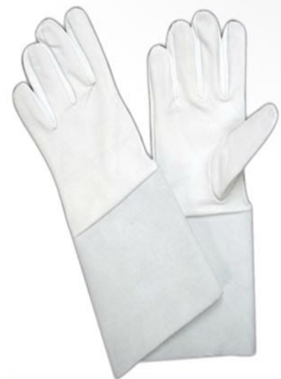
Code : SS-1302

Tig welding glove made by goat leather and cuff of cow split leather