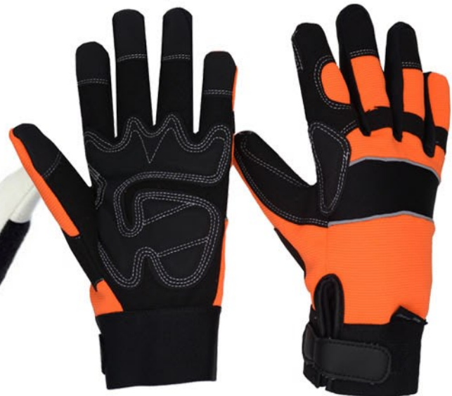
Code : SS-1928

Made by synthetic leather and fine fabric