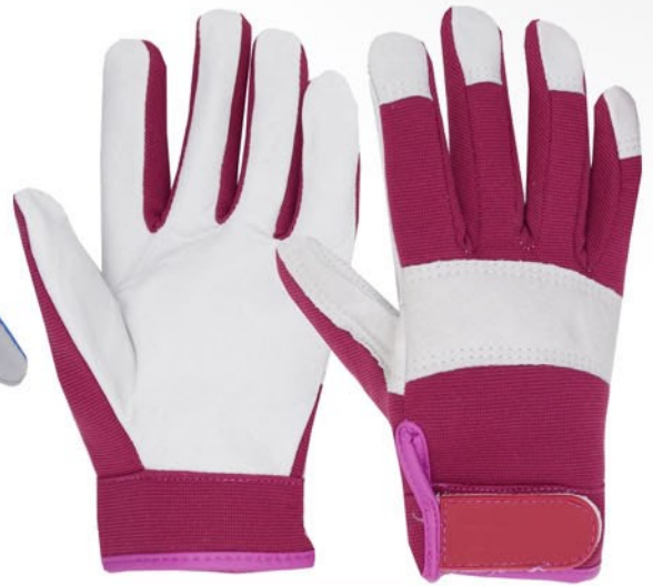
Code : SS-1918