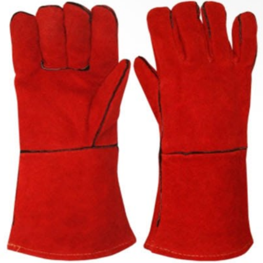
Code : SS-1306