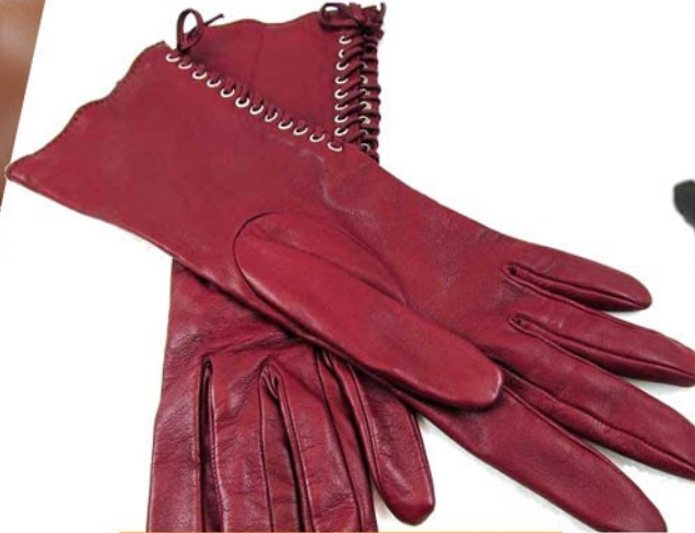
Code : SS-2105