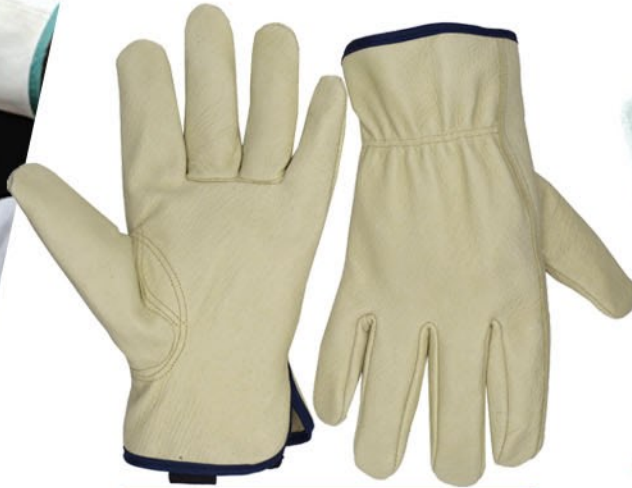
Code : SS-1517