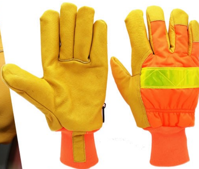
Code : SS-1519

Made by buffalo dyed leather and high-vis fabric