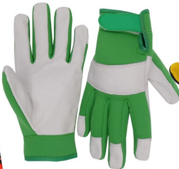
Code : SS-1919