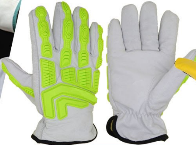
Code : SS-1525