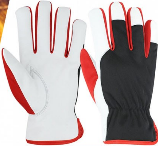
Code : SS-91001

Constructed of soft and strong goat skin leather provides the gloves excellent dexterity and touch sensitivity.