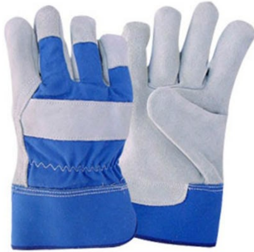
Code : SS-1705

Canadian style work gloves made by cow split leather and rubberized fabric cuff