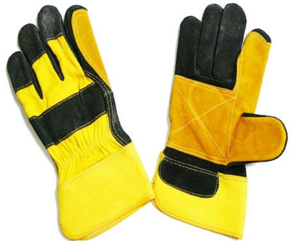
Code : SS-1708

Canadian style work gloves made by cow split leather and rubberized fabric cuff