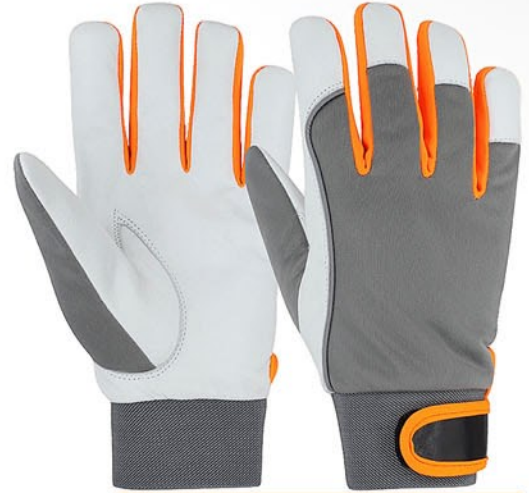
Code : SS-91002

Constructed of soft and strong goat skin leather provides the gloves excellent dexterity and touch sensitivity.