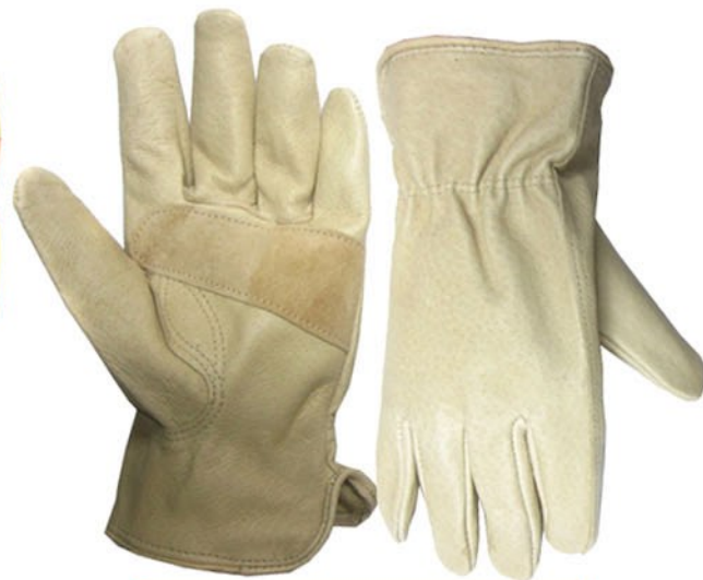
Code : SS-1520