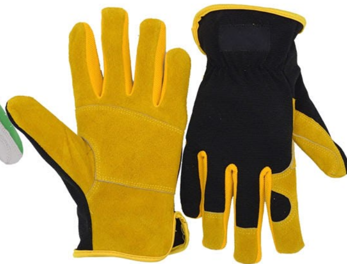
Code : SS-1920