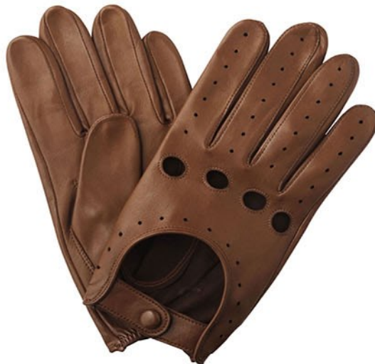
Code : SS-2107