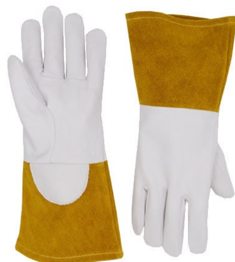
Code : SS-1316

Tig welding glove made by goat leather and cuff of cow split leather