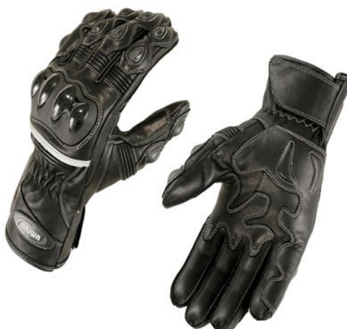
Code : SS-2903