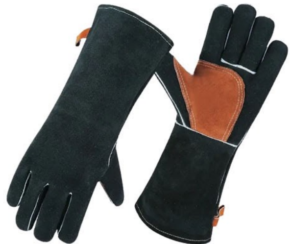
Code : SS-1304

Tig welding glove made by goat leather and cuff of cow split leather