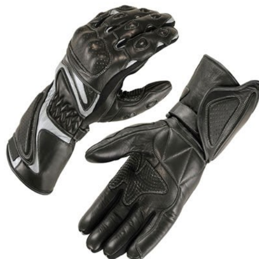
Code : SS-2904