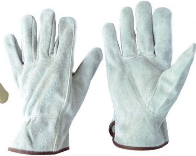
Code : SS-1518