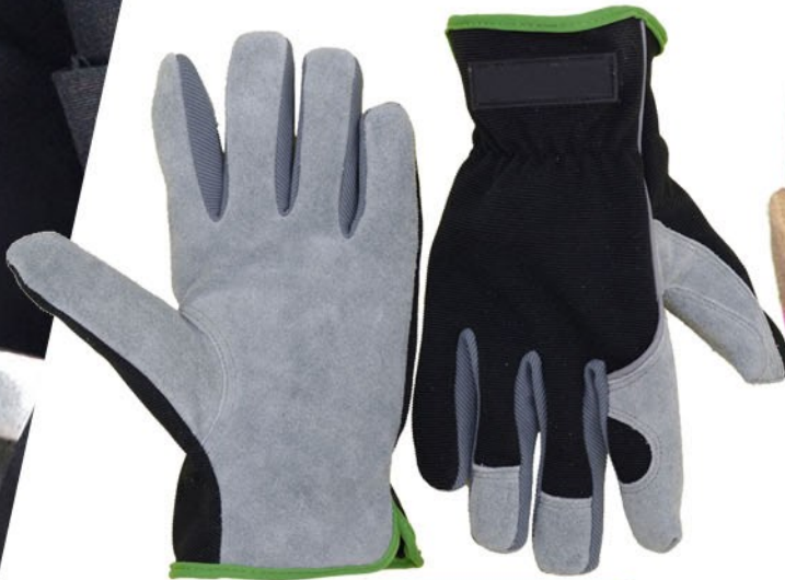
Code : SS-1925

Made by cow split dyed leather and fine fabric