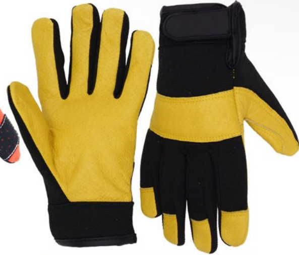
Code : SS-1914

Made by goat dyed leather and fine fabric