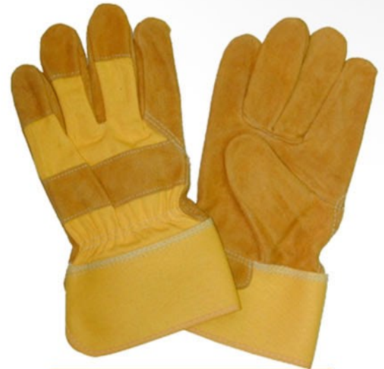
Code : SS-1706

Canadian style work gloves made by cow split leather and rubberized fabric cuff