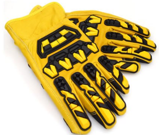
Code : SS-1528