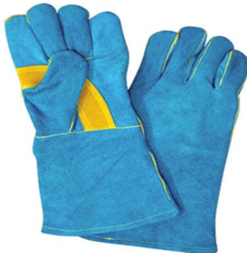
Code : SS-1307