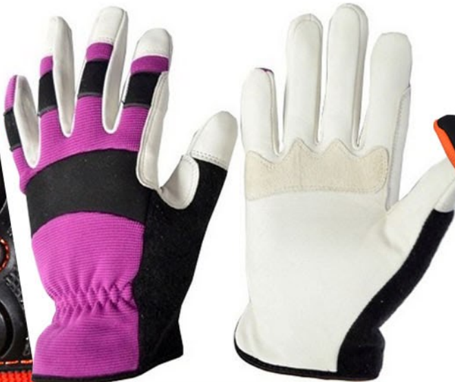
Code : SS-1927