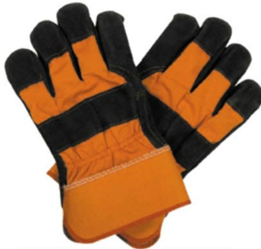
Code : SS-1707

Canadian style work gloves made by cow split leather and rubberized fabric cuff