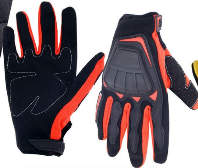
Code : SS-1913

Made by synthetic leather and fine fabric