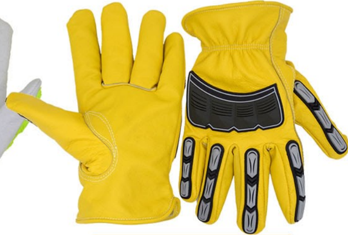
Code : SS-1526