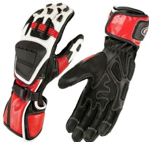
Code : SS-2901