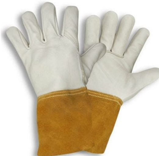
Code : SS-1303

Tig welding glove made by goat leather and cuff of cow split leather