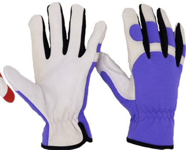
Code : SS-1916