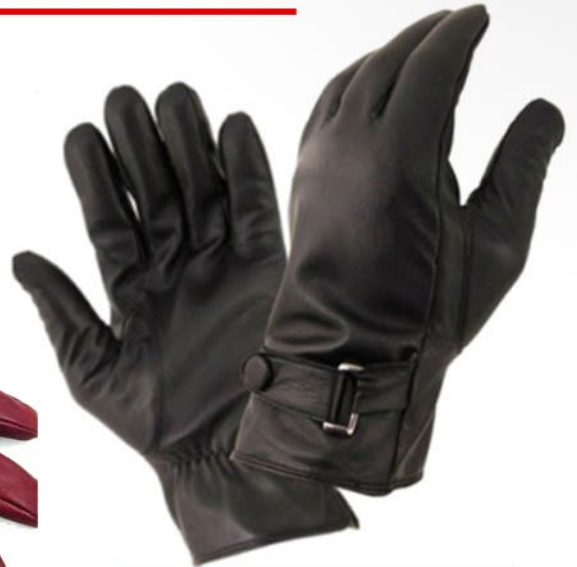
Code : SS-2106