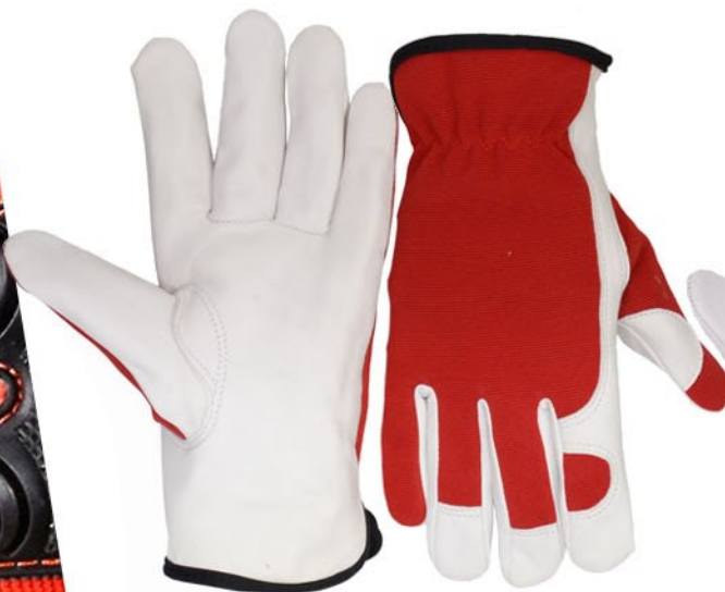
Code : SS-1915