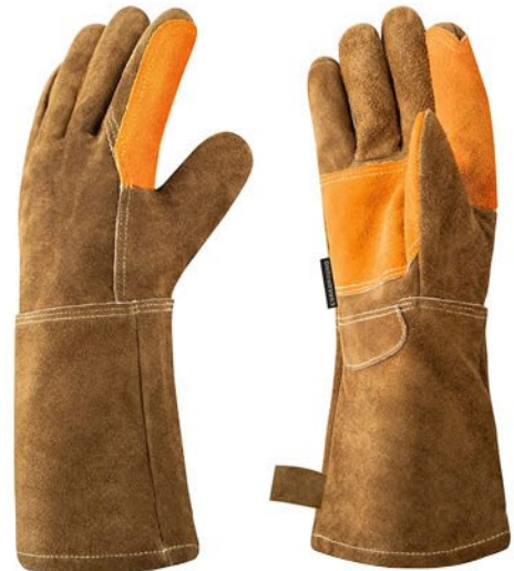
Code : SS-1308