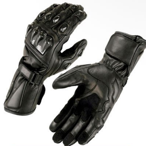
Code : SS-2902