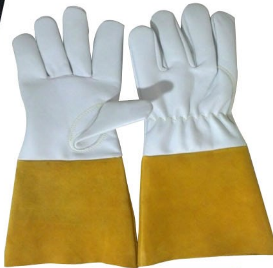
Code : SS-1301

Tig welding glove made by goat leather and cuff of cow split leather