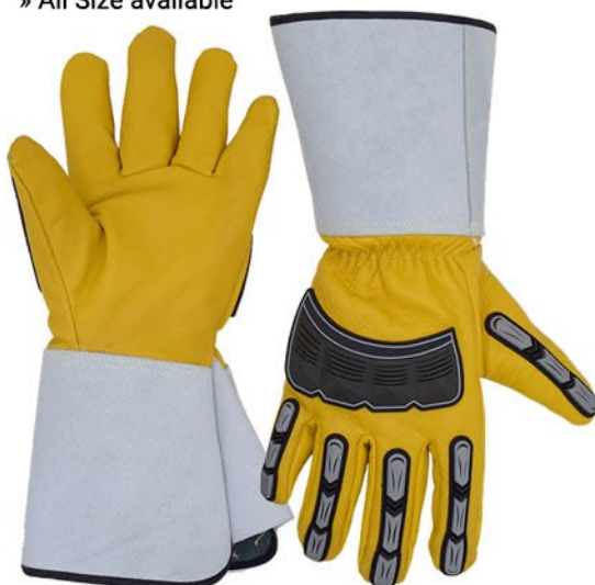
Code : SS-1315

Tig welding glove made by goat leather and cuff of cow split leather