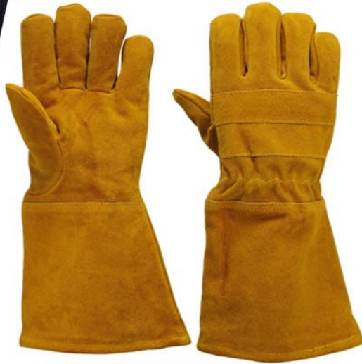
Code : SS-1305