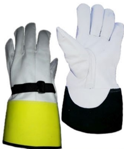
Code : SS-1313

Electric glove made by Goat leather and cuff with cow split leather & rubberized fabric